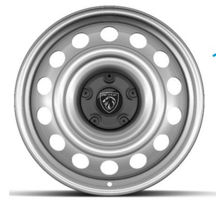
15/16" Steel Wheels